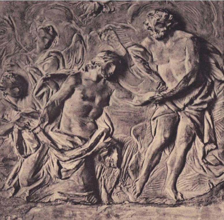
5b. Pietro Bracci, Baptism of Christ , preparatory model