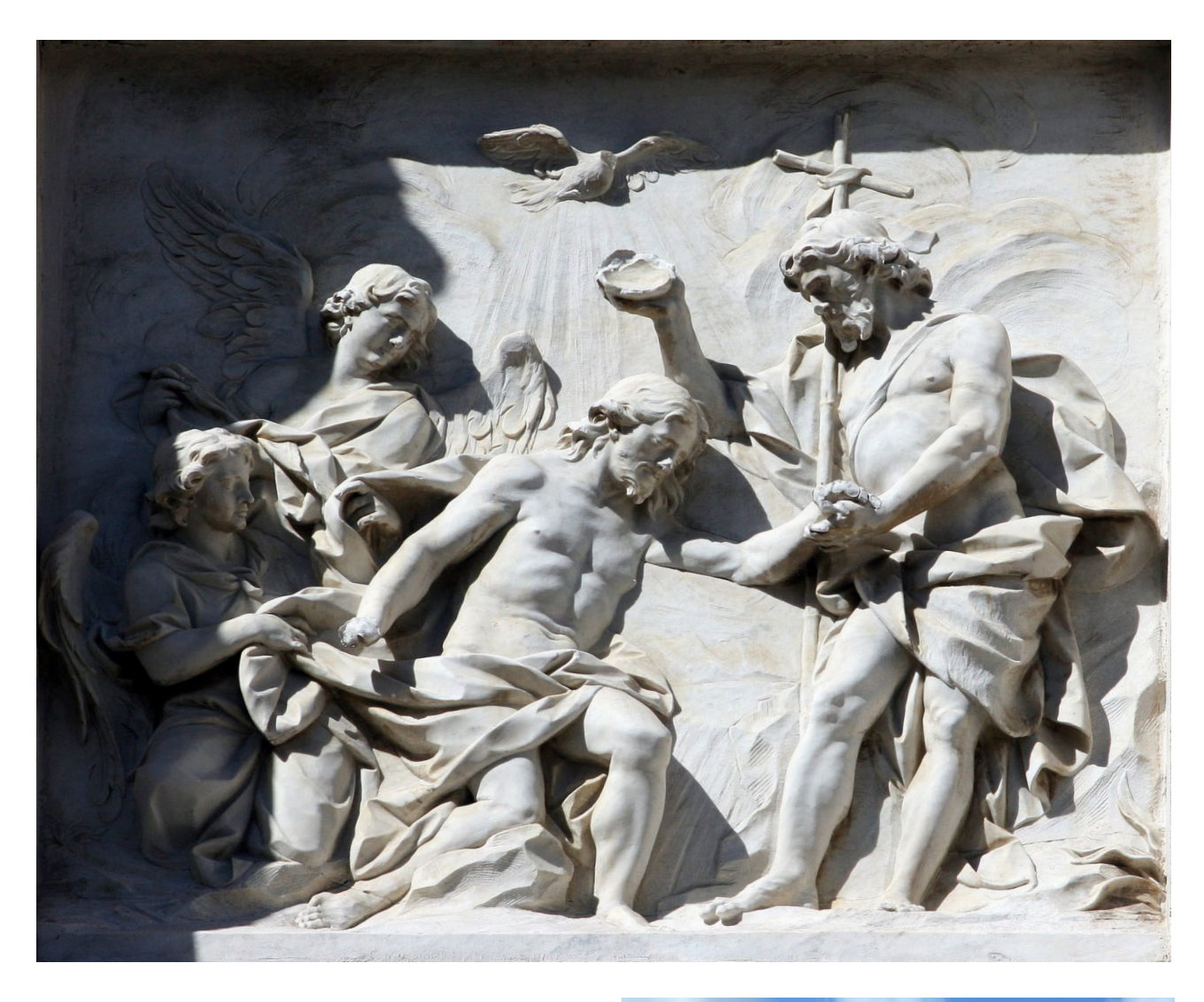
2. Pietro Bracci, Baptism of Christ . Rome, detail of the facade of San Giovanni dei Fiorentini