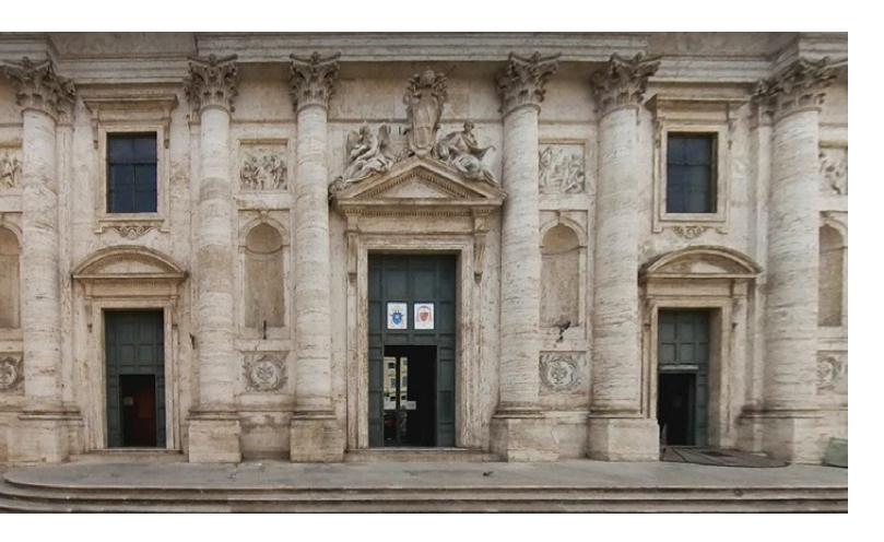
4. Rome, detail of the facade of San Giovanni dei Fiorentini

schini 1925, p. 271), revealed that Galilei commissioned the reliefs from four sculptors. The document was signed on 6 September 1734 by Pietro Bracci for the Baptism of Christ , Filippo Della Valle for the Preaching of the Baptist , Domenico Scaramuccia for the Beheading , and finally, Paolo Benaglia for the Visitation , with the com-